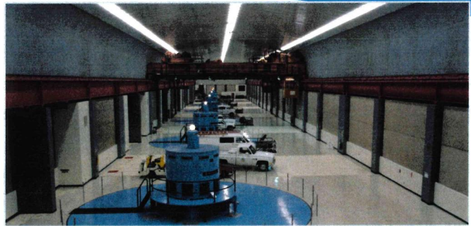
Hyatt Power Plant

San Luis Reservoir , with a capacity of more than 2 million acre-feet is the largest off-stream reservoir in the nation. San Luis is a joint-use facility, storing water for both the SWP and the federal Central Valley Project. The SWP portion of San Luis is 1.062 million acre-feet.