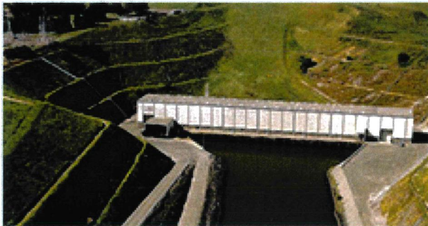
Harvey O. Banks Pumping Plant